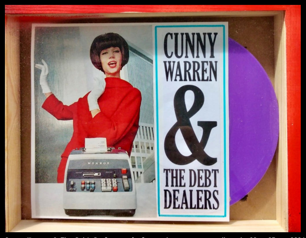
Cunny Warren & The Debt Dealers, vinyl, wood, perspex, cardboard, 20 x 25cm, 2024

A hand-crafted tribute to the 45rpm 7" Created and Assembled by Scotti FMR